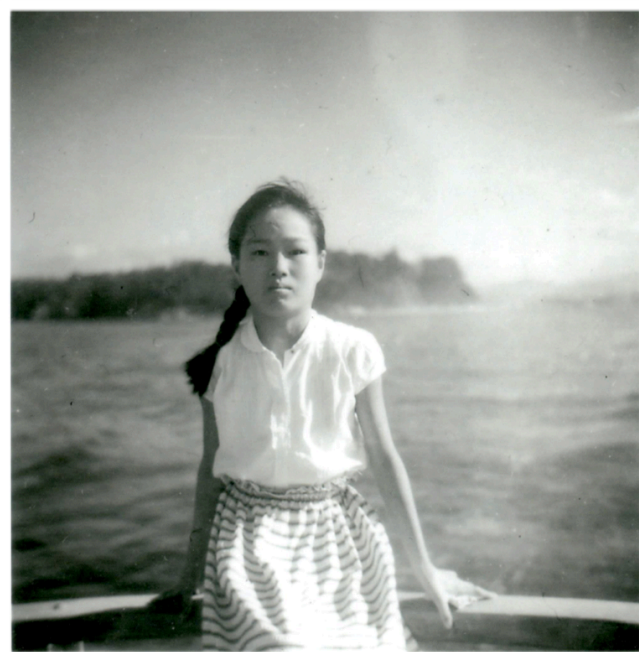
Sadako Sasaki (1955)