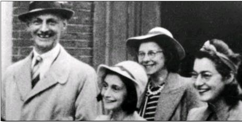
Otto, Anne, Edith, and Margot Frank