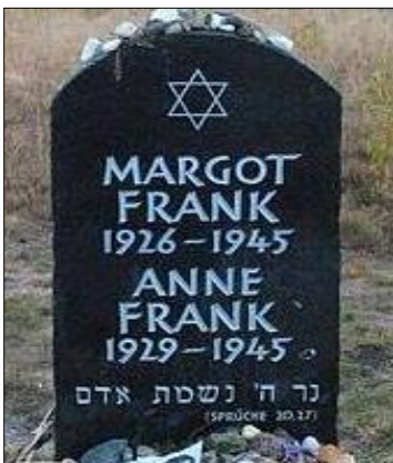
Bergen-Belsen Concentration Camp (Germany)